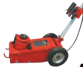
22 TON HYDRAULIC FLOOR JACK

LARGER 5 Ton, 10 ton Floor jacks are available